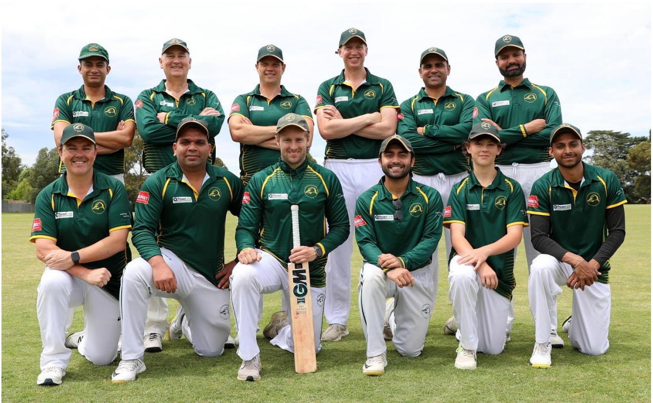
Second XIs Captains